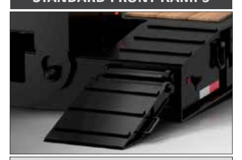
Standard Steel Front ramps, for ease of front loading.