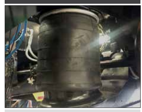
30K pound rated large diameter air bags are standard. This allows for lower operating pressure and higher capacity when needed.