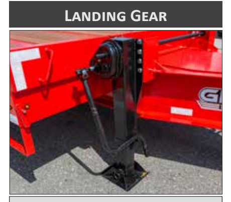
2 speed Landing Gear, allows for 160,000 lbs static load.