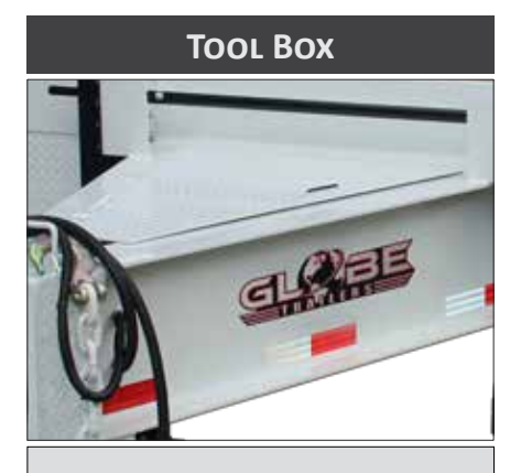
Lockable tool box with anti theft provisions available.