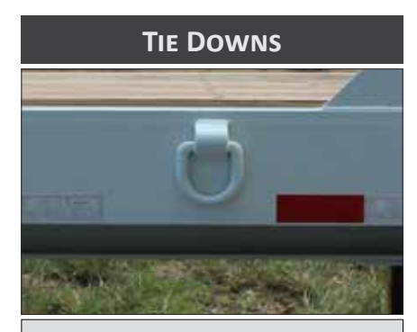
D-rings on each side of the deck make it easier to secure loads to the trailer.

All Globe trailers come with standard HUB piloted disc wheels. Wheels are also available in all Aluminum or Outer Aluminum.