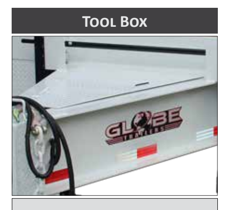
Lockable tool box with anti theft provisions available.