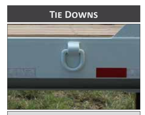
D-rings on each side of the deck make it easier to secure loads to the trailer.

All Globe trailers come with standard HUB piloted disc wheels. Wheels are also available in all Aluminum or Outer Aluminum.