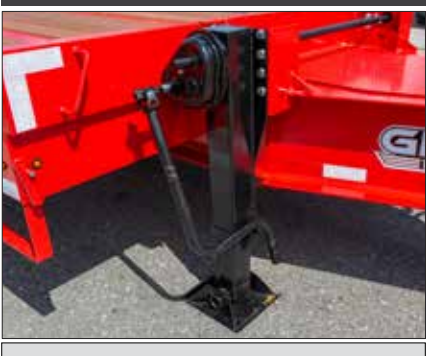
2 speed Landing Gear, allows for 160,000 lbs static load.