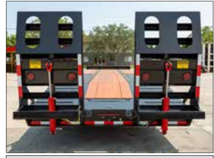
Hydraulic ramp upgrade available for easier use.