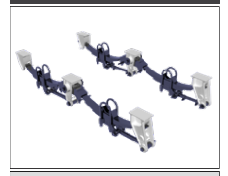
Heavy duty tandem-axle spring ride suspension.