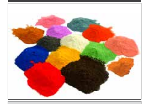
Globe Trailers can powder coat to the color of your choice.