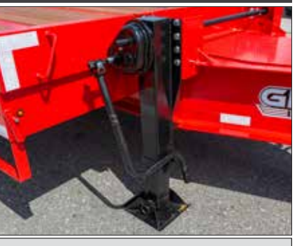
2 speed Landing Gear, allows for 160,000 lbs static load.