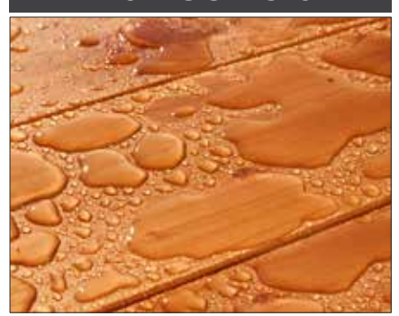
Oak: Standard. Apitong : Best strength to weight ratios of natural woods. Rumber : Composite which is impervious to fluids, mud, oil and UV rays.