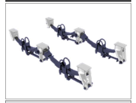
Heavy duty tandem-axle spring ride suspension.