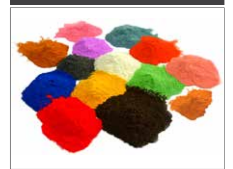
Globe Trailers can powder coat to the color of your choice.