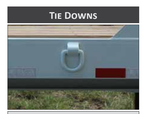
D-rings on each side of the deck make it easier to secure loads to the trailer.

All Globe trailers come with standard HUB piloted disc wheels. Wheels are also available in all Aluminum or Outer Aluminum.