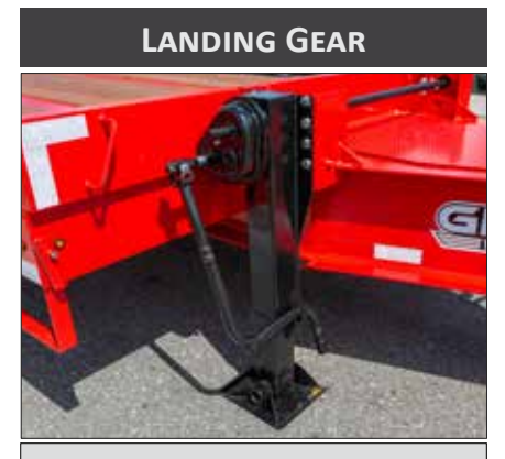
2 speed Landing Gear, allows for 160,000 lbs static load.