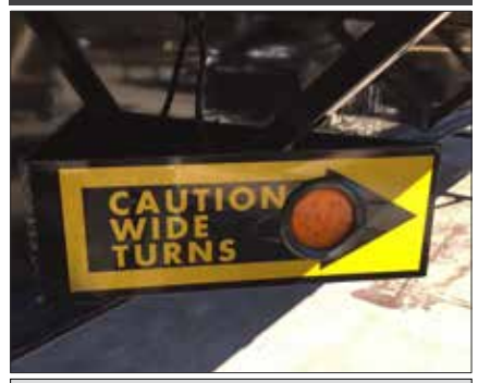
Optional wide turn indicators available.