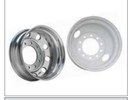
All Globe trailers come with standard HUB piloted disc wheels. Wheels are also available in all Aluminum or Outer Aluminum.