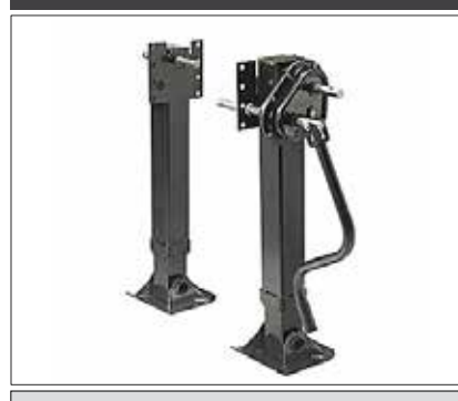
2 speed Landing Gear, allows for 160,000 lbs static load.