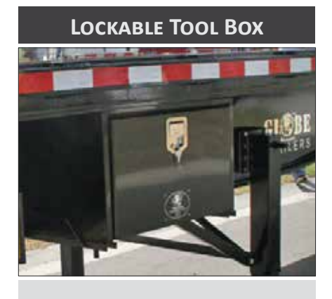
Optional Lockable Tool Box Mounted Underside of Main Deck, 24" x 24" x 48" Steel, can be located on either side.