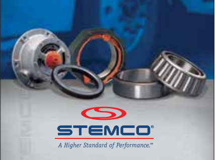
5 year wheel end warranty. Guardian wheel seals, Pro-Torq spindle nuts and Sentinel hub caps.