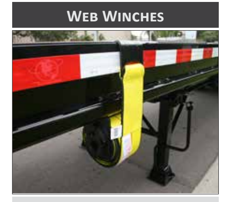
Web winches can be located on either side. Used to secure loads and objects on the trailer.