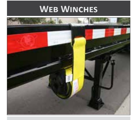
Web winches can be located on either side. Used to secure loads and objects on the trailer.