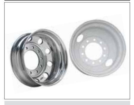
All Globe trailers come with standard HUB piloted disc wheels. Wheels are also available in all Aluminum or Outer Aluminum.