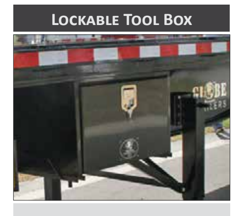
Optional Lockable Tool Box Mounted Underside of Main Deck, 24" x 24" x 48" Steel, can be located on either side.