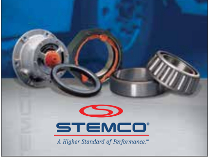
5 year wheel end warranty. Guardian wheel seals, Pro-Torq spindle nuts and Sentinel hub caps.