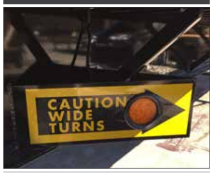
Optional wide turn indicators available.