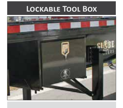
Optional Lockable Tool Box Mounted Underside of Main Deck, 24" x 24" x 48" Steel, can be located on either side.