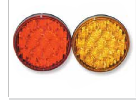
All Lighting is LED and mounted in rubber grommets to DOT standards.