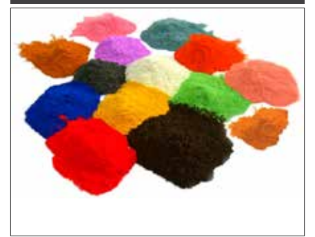
Globe Trailers can powder coat to the color of your choice.