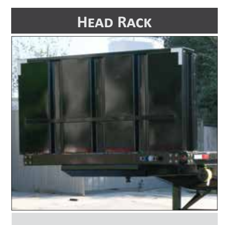
Optional detachable steel bulkhead, 48" high with optional work lights.