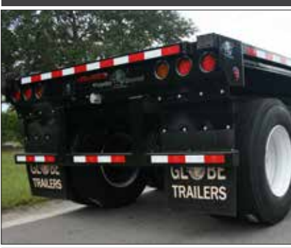
DOT certified rear under ride bumper with high visibility reflective tape and rubber docking bumpers.