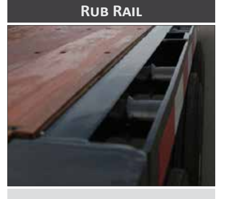
2 ½" rolled formed steel. 6" Structural Channel @ 6.5 lbs/ft, 5/16" Thick Stake Pockets 1 5/8" x 3 ½" x ¼", 24" O/C, ¼" x 3" Rub rail.