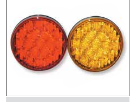
All Lighting is LED and mounted in rubber grommets to DOT standards.