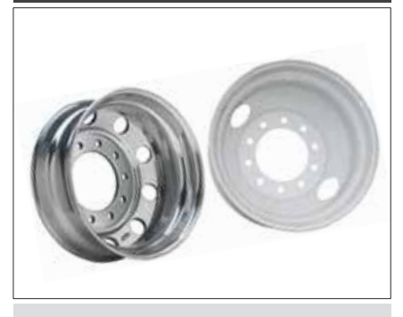
All Globe trailers come with standard HUB piloted disc wheels. Wheels are also available in all Aluminum or Outer Aluminum.