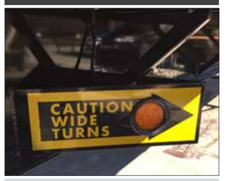
Optional wide turn indicators available.