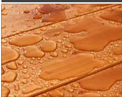
Oak: Standard. Apitong: Best strength to weight ratios of natural woods. Rumber: Composite which is impervious to fluids, mud, oil and UV rays.