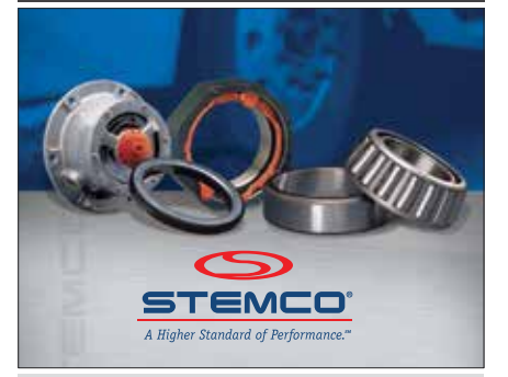
5 year wheel end warranty. Guardian wheel seals, Pro-Torq spindle nuts and Sentinel hub caps.