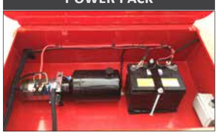
Power pack option for rear hydraulic ramps.