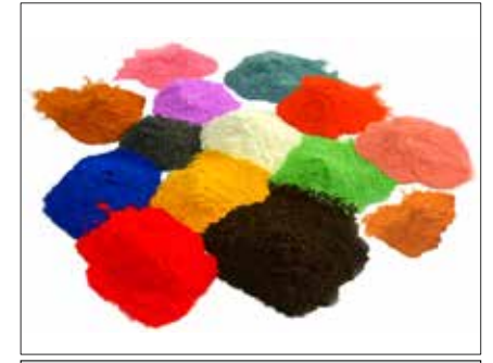
Globe Trailers can powder coat to the color of your choice.