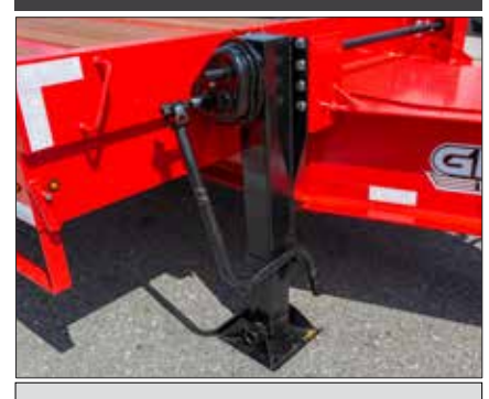
2 speed Landing Gear, allows for 160,000 lbs static load.