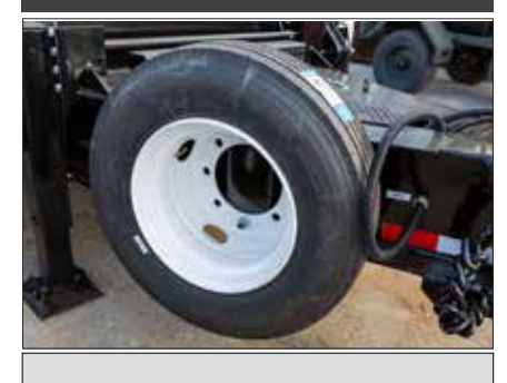
Optional spare tire that mounts securely at the side of the drawbar