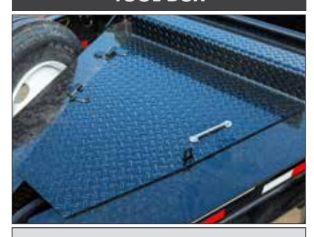
Lockable tool box with anti theft provisions available.