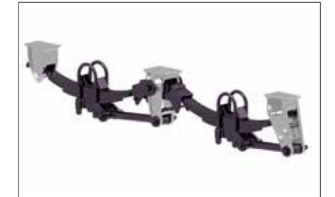
Heavy Duty tandem suspension.