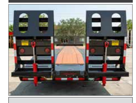
Hydraulic ramp upgrade available for easier use.