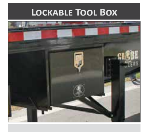
Optional Lockable Tool Box Mounted Underside of Main Deck, 24" x 24" x 48" Steel, can be located on either side.