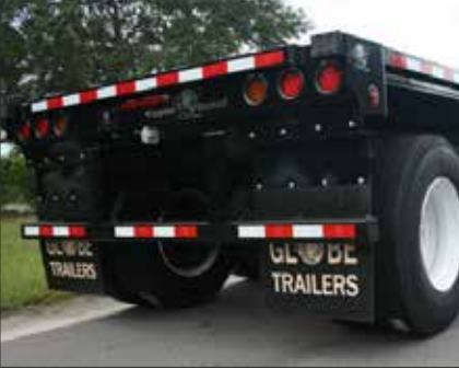
DOT certified rear under ride bumper with high visibility reflective tape and rubber docking bumpers.