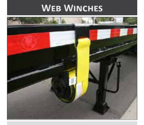
Web winches can be located on either side. Used to secure loads and objects on the trailer.