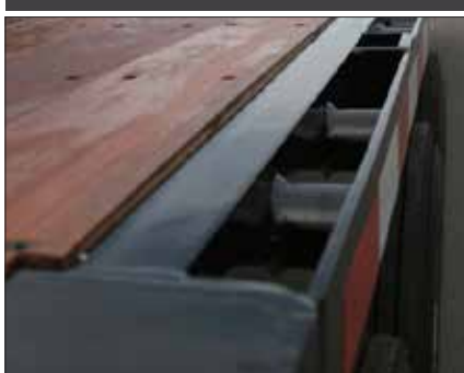
2 ½" rolled formed steel. 6" Structural Channel @ 6.5 lbs/ft, 5/16" Thick Stake Pockets 1 5/8" x 3 ½" x ¼", 24" O/C, ¼" x 3" Rub rail.