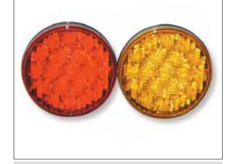
All Lighting is LED and mounted in rubber grommets to DOT standards.