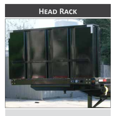
Optional detachable steel bulkhead, 48" high with optional work lights.