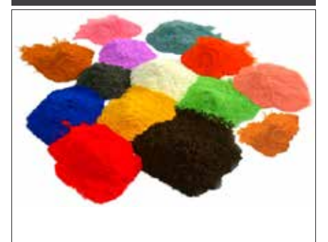
Globe Trailers can powder coat to the color of your choice.